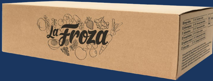
TRANSPORT BOX SMALL